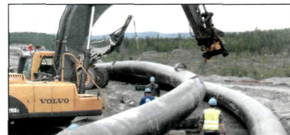
Pumps & Piping...68