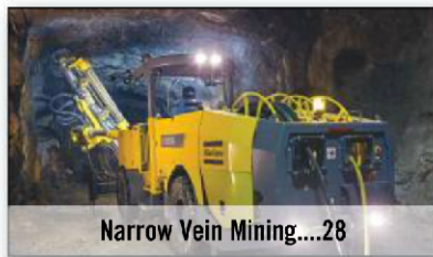
Narrow Vein Mining....28