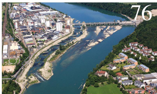
Digital Object Identifier 10.1109/MPE.2016.2574162