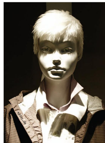
ON THE COVER: ALBINO DOLL SCULPTURE WITH A HUMAN-LIKE ROBOT FACE.