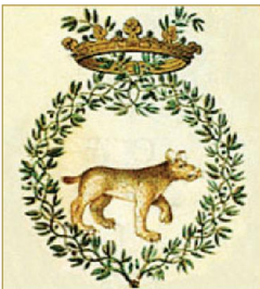
Learned Societies - Past, Present & Future.....p. 150